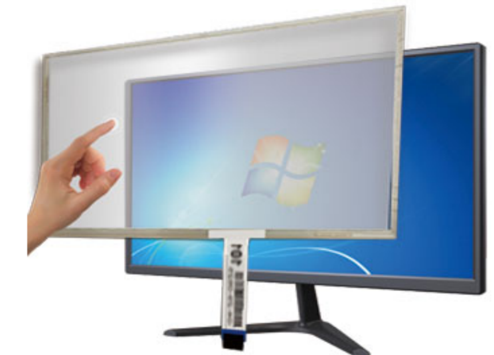
5 WIRE RTP W/EETI